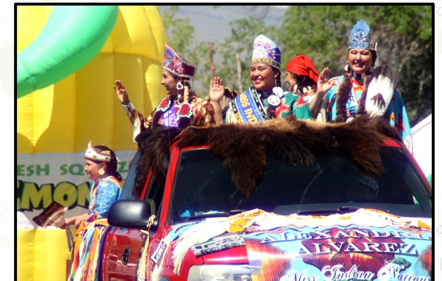
Pageant Royalty at the 2014 Shoshone Powwow.

Community Wraparound is an extensive and long-term intervention that has the potential to greatly impact the WRR community with the necessary support. When presenting this program, I surprisingly discovered that there had been a former failed mentorship program on the WRR. In order to avoid the same fate, it was suggested that Community Wraparound start with a strong mission statement, stringent participation requirements, and outlined goals. To be successful the program needs a board of directors, a small endowment, and a commitment from IHS Community Public Health Program to facilitate easy integration and correct dissemination of educational material. There was strong feedback that the program was directed by and serving Native stakeholders to direct the fate of the health within their own community.