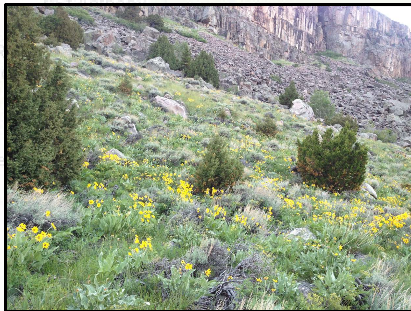
Hike in the Wind River Mountains near WRR

The goal of Community Wraparound is to improve poverty-induced deficits of childhood: health, development, education, and cultural awareness on the Wind River Reservation (WRR) through a mentorship program.